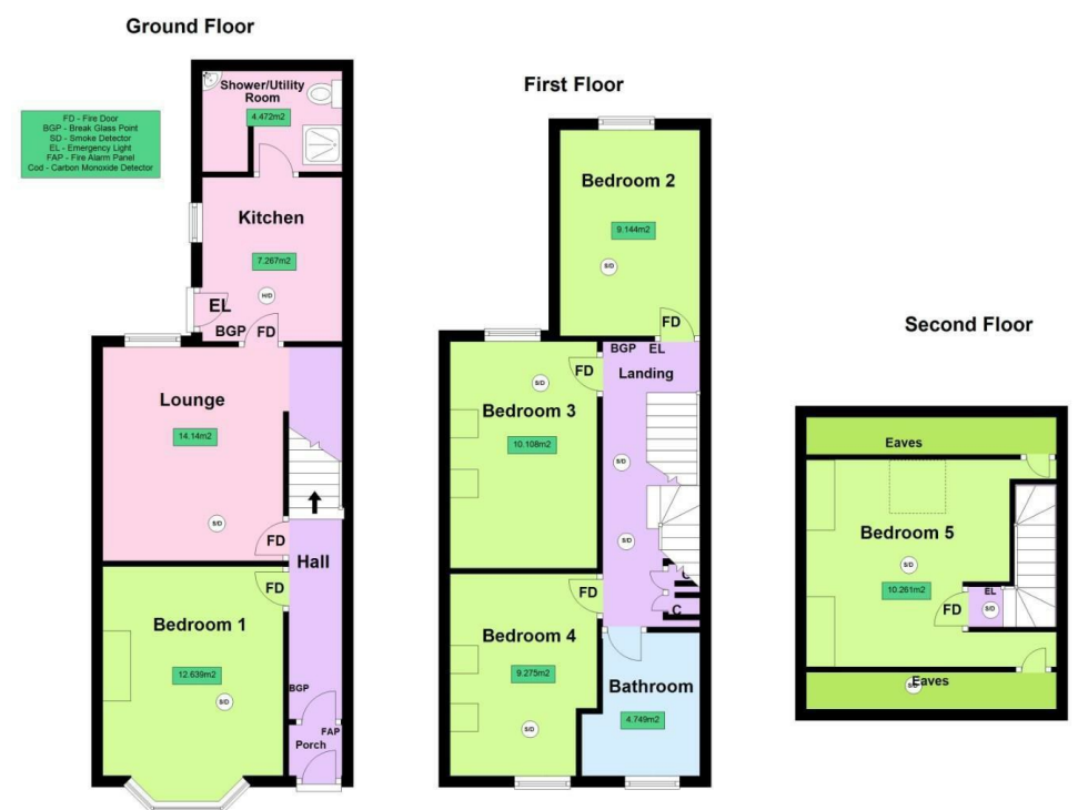
71 Beckhampton Road, Bath

VIEWING AND OFFER PROCEDURE: If you wish to view this property, please contact our office on the number provided. All offers on this property should be made through this office. In order to fulfill our responsibilities to the seller, when offering on this property, you will be asked a series of questions about how you intend to fund the purchase and whether or not your offer is dependent on the sale of another property. This information provided by you, along with the amount of your offer, will then be forwarded onto the seller for consideration.